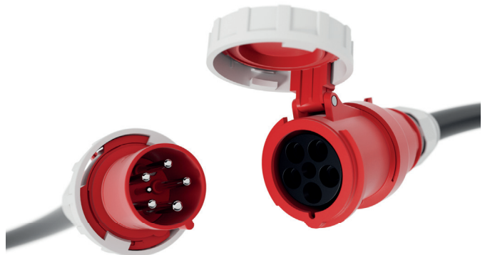
KONTEX-ULTRA available in versions from 63 to 125A.

Bals Nederland B.V. Watze Hilariusweg 6 2031 AA Haarlem T: +31235470947 verkoop@bals.nl www.bals.nl